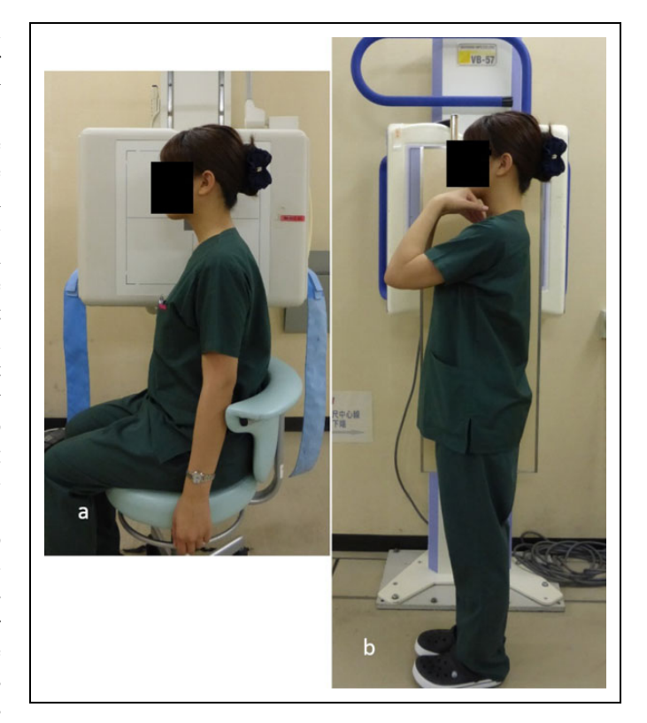
Figure 1. Radiographic positioning for evaluating cervical alignment. (a) Patient positioning for sitting cervical lateral radiographs: the patient adopts a relaxed sitting position, with the arms extended and hands on either side. (b) Patient positioning for standing whole-spine lateral radiographs with clavicle positioning: the patient adopts the "clavicle position," with the elbows flexed and fingers in the supraclavicular fossae. In both positions, the patient is looking straight ahead.

We retrospectively reviewed the clinical data of 110 consecutive patients who underwent cervical surgery for CSM between September 2012 and December 2015 at our hospital. We excluded cases involving a history of spinal surgery, trauma, ossification of the posterior longitudinal ligament, atlantoaxial subluxation, difficulty to conduct accurate radiographic measurements due to the shadow of the shoulder, or inability of the patient to stand independently or to achieve adequate clavicle positioning. In total, 50 cases were included in our analysis. All